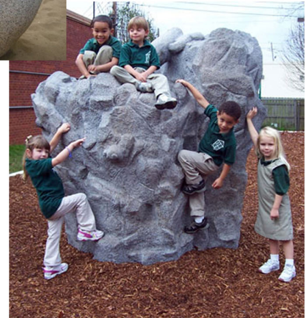
SCULPTURAL PLAY ELEMENT