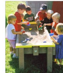
(MAG #4) SAND TABLE

NOTES: 1) COLORS OF PLAY SURFACE SHOULD MATCH THE FOUR EXISTING COLORS OF THE ARTFUL SHADE STRUCTURE 2) CONTRACTOR IS RESPONSIBLE FOR FINAL DESIGN OF ALL LIFE COMPONENTS 3) CONTRACTOR TO VERIFY ALL WORK IS IN COMPLIANCE WITH ALL GOVERNING OR APPLICABLE CODES AND ORDINANCES INCLUDING, BUT NOT LIMITED TO THE FOLLOWING: DC, ASHRAE, DISTRICT OF COLUMBIA CODES, CHESAPEAKE BAY WATERSHED RESTORATION, ETC. 4) ALL EX. TREES ARE TO REMAIN, EX. TREES ARE SHOWN AT APPROPRIATE LOCATION. CONTRACTOR TO ENSURE NECESSARY TREE PROTECTION MEASURES AS PER D.C. STANDARDS.