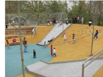
(MAG #1) ROPE CLIMBING STRUCTURE. SLIDE ON GRADE.