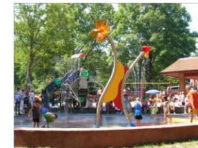
(MAG #3) WATER BUBBLER SPRAY PARK